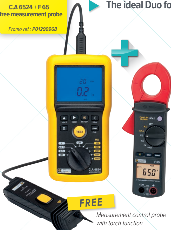
Measurement control probe with torch function