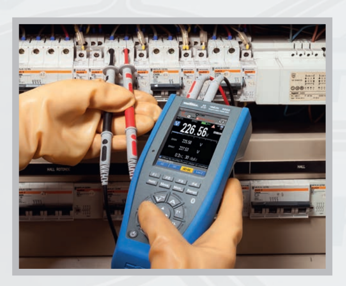
Measurements on electrical cabinets