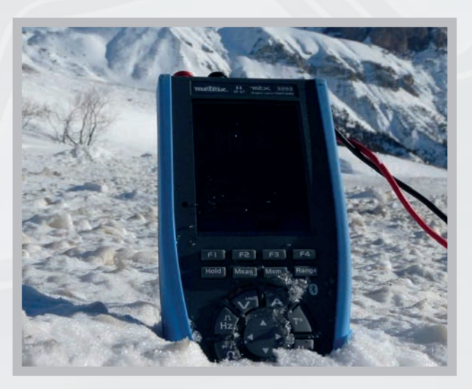
The IP67 protection of the ASYC IV models means they can handle applications in difficult environments